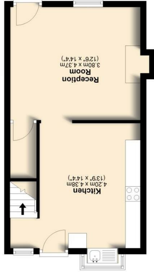
Ground Floor Approx. 35.7 sq. metres (384.0 sq. feet)